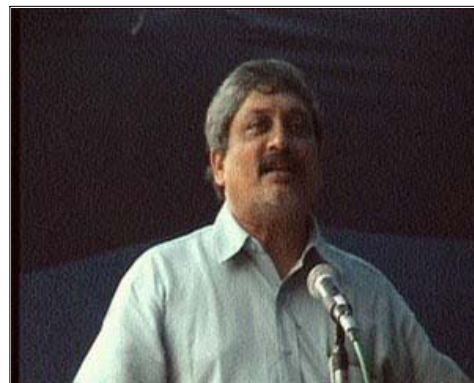
HIDING SOMETHING: Manohar Parrikar